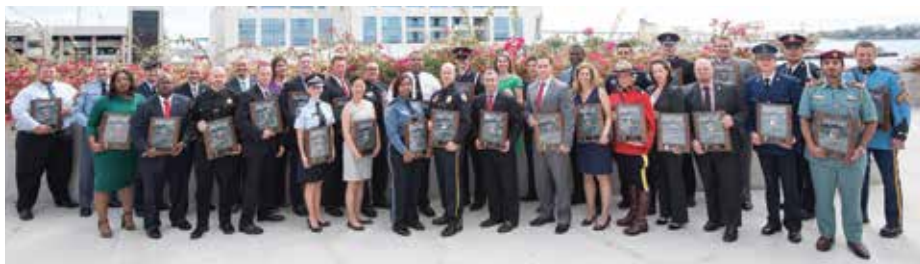
2016 40 Under 40 Awardees

Please visit www.theIACP.org/40under40 for a full listing of the awardees.